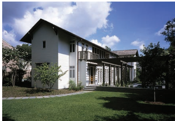
south blvd. house